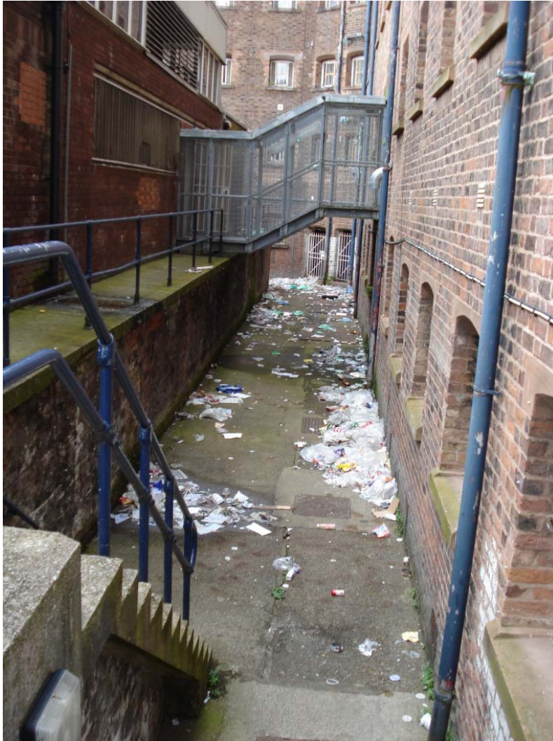
Litter in an outside area