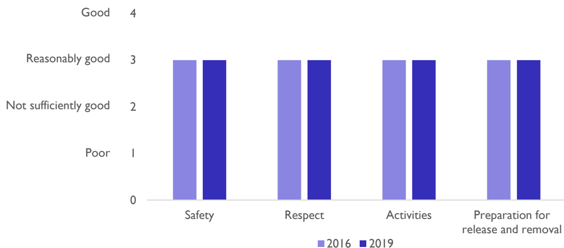
Figure 2: Brook House IRC healthy establishment outcomes 2016 and 2019 2