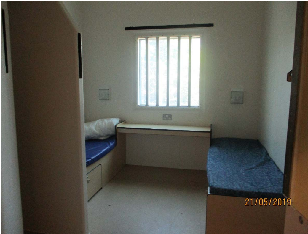
Cell on B wing