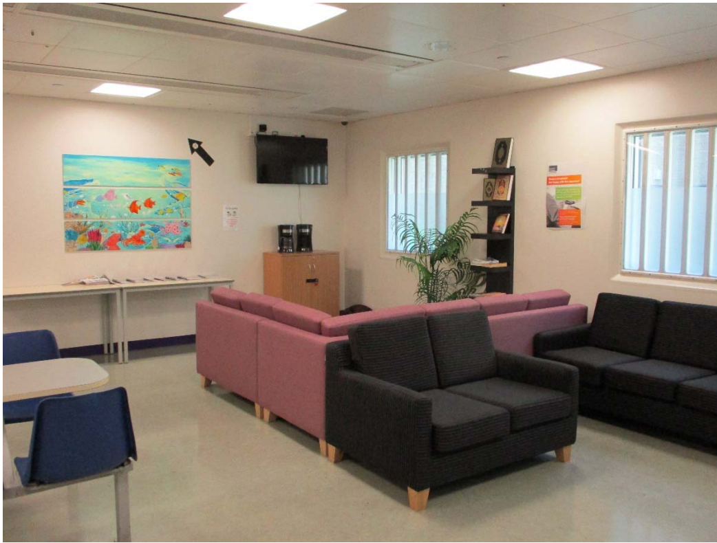
Reception waiting area holding room