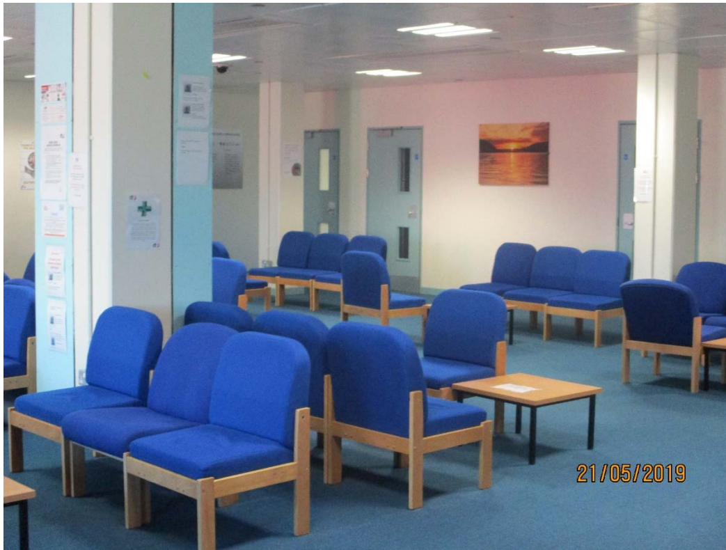
Social visits room